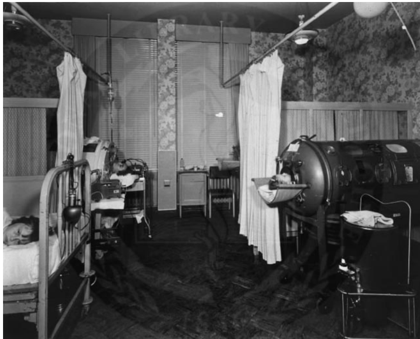
Iron lungs in poliomyelitis ward Latter-Day Saints Hospital Salt Lake City, Utah, 1949