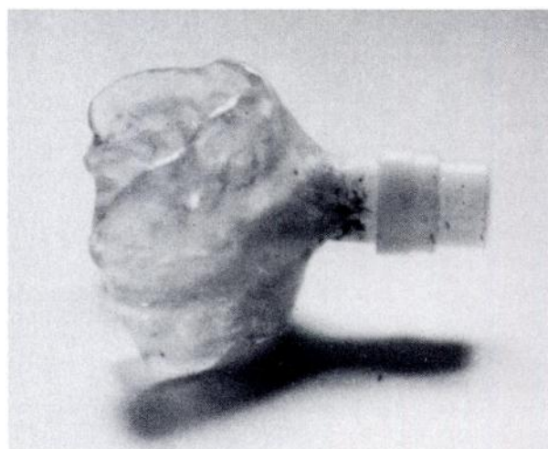
FIGURE 2. Acrylic orthodontic mouthpiece for firm and comfortable retention without straps.

Although many patients began using nocturnal mouth IPPV without lip seal fixation of the mouthpiece in the mouth, most patients eventually converted to the more effective lip seal retention systems (Fig 1). These retain the mouthpiece firmly in the mouth during sleep and diminish insufflation leakage out of the mouth. Four patients used custom molded orthodontic acrylic mouth pieces without lip seals (Fig 2) for more comfortable and firm retention without the use of straps. Custom acrylic mouthpiece-lip seals (Fig 3) firmly retain the mouthpiece, seal the lips, and can seal the nose during sleep. These were used by eight individuals. Five of the 163 individuals who used mouth IPPV during sleep plugged their noses with cotton pledgets kept in place with tape or used nose