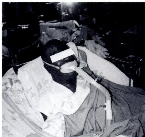
FIGURE 1. Mouth IPPV with lip seal retention of the mouthpiece for nocturnal ventilatory support.

All motivated patients with oropharyngeal muscle strength adequate for swallowing and intelligible speech were successful in using mouth IPPV for ventilatory support. Some individuals, particularly those with lower vital capacity in a supine position than when sitting, initially required only part-time ventilatory assistance, usually during sleep. Of these, 29 continued to require only nocturnal assistance, 11 only daytime assistance, 73 went on to use noninvasive methods of ventilatory support up to 20 h/d, and 144 became ventilator supported around the clock. Of the latter two groups, 178 were either switched from less effective body ventilators to mouth IPPV or used